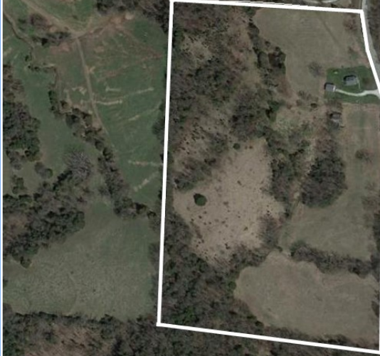
Country Home on 24 Acres m/l